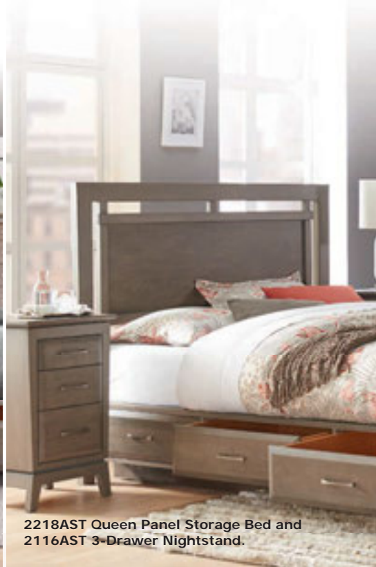
2218AST Queen Panel Storage Bed and 2116AST 3-Drawer Nightstand.