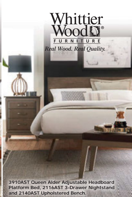
3910AST Queen Alder Adjustable Headboard Platform Bed, 2116AST 3-Drawer Nightstand and 2140AST Upholstered Bench.