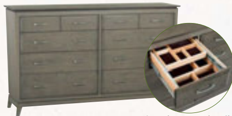
Jewelry tray detail.