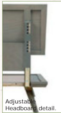
Adjustable Headboard detail.