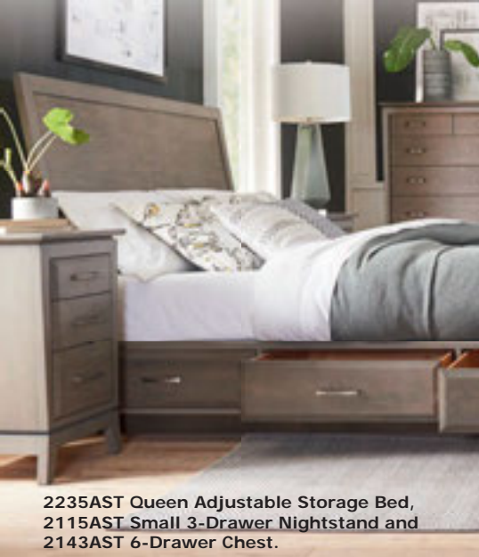
2235AST Queen Adjustable Storage Bed, 2115AST Small 3-Drawer Nightstand and 2143AST 6-Drawer Chest.